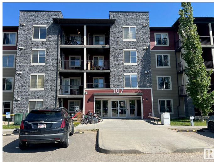
101-107 Watt Common SW, Edmonton, AB