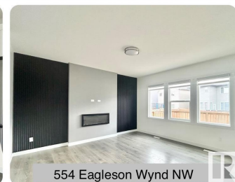
554 Eagleson Wynd NW